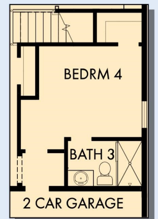
OPTIONAL BEDROOM 4 WITH BATH 3 AT STUDY