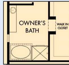
OPTIONAL DROP IN TUB WITH SEPARATE SHOWER AT OWNER'S BATH