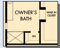
OPTIONAL SHOWER AT OWNER'S BATH