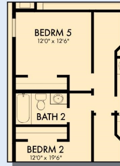
OPTIONAL BEDROOM 5 AT RETREAT