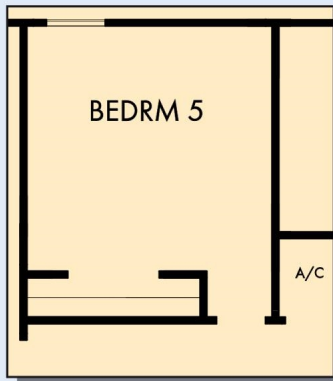
OPTIONAL BEDROOM 5 AT RETREAT