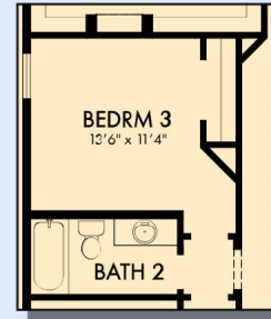
OPTIONAL BEDROOM 3 AT STUDY