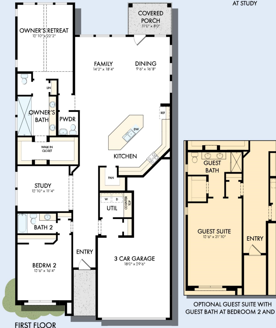
OPTIONAL GUEST SUITE WITH GUEST BATH AT BEDROOM 2 AND 3