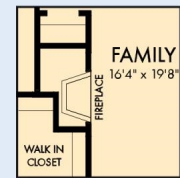
OPTIONAL WALL FIREPLACE AT FAMILY