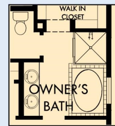
OPTIONAL DROP IN TUB WITH SEPARATE SHOWER AT OWNER'S BATH