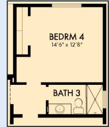
OPTIONAL BEDROOM 4 WITH BATH 3 AT SUNROOM