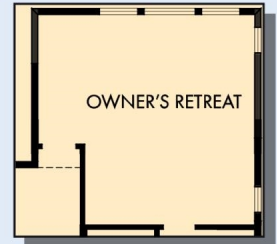
OPTIONAL EXTENDED OWNER'S RETREAT