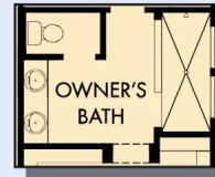
OPTIONAL SUPER SHOWER AT OWNER'S BATH