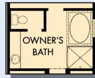
OPTIONAL DROP-IN TUB WITH SEPARATE SHOWER AT OWNER'S BATH

2,961 - 3,036 sq. ft. • 4 Bedrooms • 3 Full Baths • 1 Half Bath • 3 Car Garage