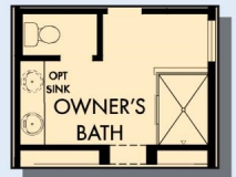
OPTIONAL SHOWER AT OWNER'S BATH