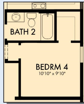
OPTIONAL BEDROOM 4 AT STUDY

2,112 - 2,126 sq. ft. • 3 - 4 Bedrooms • 3 Full Baths • 2 Car Garage