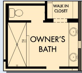
OPTIONAL SUPER SHOWER AYT OWNER'S BATH