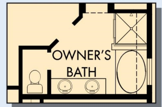
OPTIONAL SLIDE IN TUB WITH SEPARATE SHOWER AT OWNER'S BATH