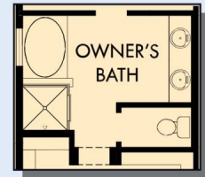
OPTIONAL SLIP IN TUB WITH SEPARATE SHOWER AT OWNER'S BATH