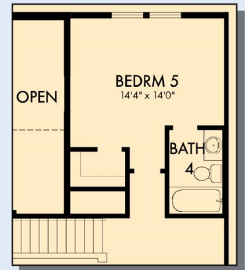
OPTIONAL BEDROOM 5 WITH BATH 4

For additional options, please visit DavidWeekleyHomes.com