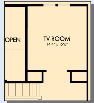
OPTIONAL TV ROOM