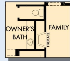
OPTIONAL WALL FIREPLACE AT FAMILY