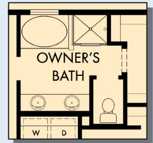
OPTIONAL SLIDE-IN TUB WITH SEPARATE SHOWER AT OWNERS BATH

For additional options, please visit DavidWeekleyHomes.com