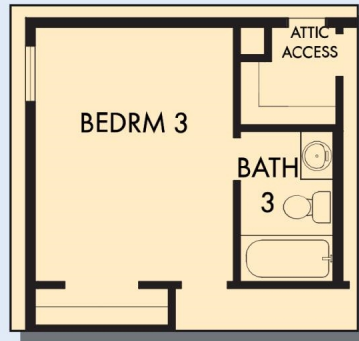
OPTIONAL BATH 3