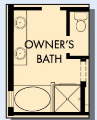
OPTIONAL SLIDE-IN TUB WITH SEPARATE SHOWER AT OWNER'S BATH