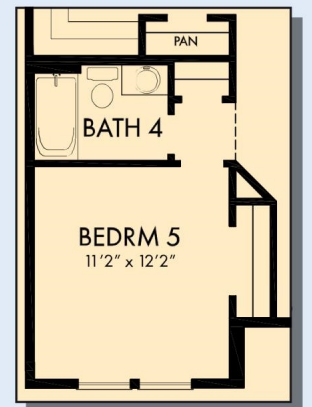
OPTIONAL BEDROOM 5 AND BATH 4 AT STUDY AND POWDER BATH