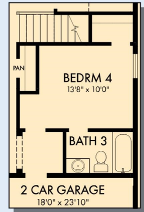
OPTIONAL BEDROOM 4 WITH BATH 3 AT STUDY