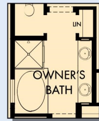
OPTIONAL DROP IN TUB WITH SEPARATE SHOWER AT OWNER'S BATH