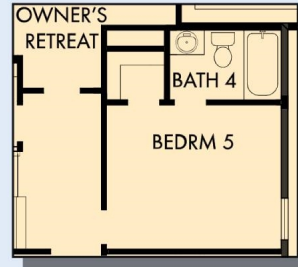
OPTIONAL BEDROOM 5 WITH BATH 4 AT RETREAT