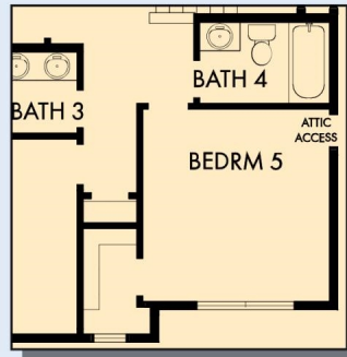
OPTIONAL BEDROOM 5 WITH BATH 4