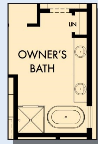
OPTIONAL FREESTANDING TUB WITH SEPARATE SHOWER AT OWNER'S BATH