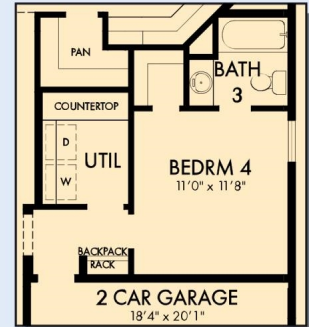
OPTIONAL BEDROOM 4 WITH BATH 3 AT GARAGE