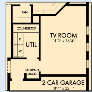
OPTIONAL TV ROOM AT GARAGE