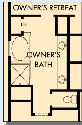
OPTIONAL SLIDE IN TUB WITH SEPARATE SHOWER AT OWNER'S BATH