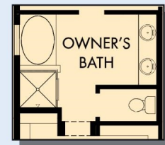
OPTIONAL SLIP IN TUB WITH SEPARATE SHOWER AT OWNER'S BATH