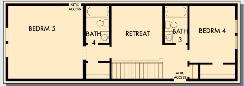
OPTIONAL BEDROOM 5 AND BATH 4 AT RETREAT