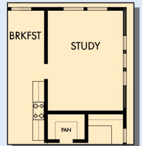
OPTIONAL 2ND STUDY AT SUNROOM