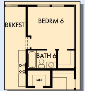
OPTIONAL BEDROOM 6 WITH BATH 6 AT SUNROOM