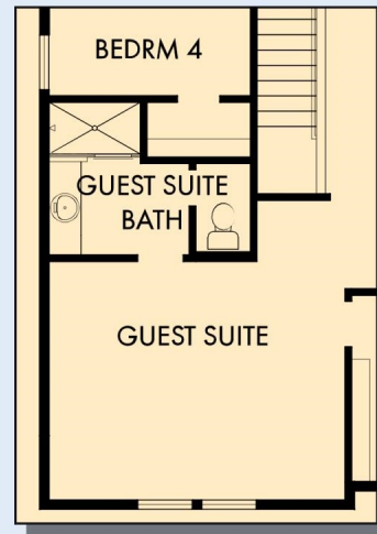
OPTIONAL GUEST SUITE AT BEDROOM 2