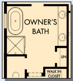
OPTIONAL FREE STANDING TUB WITH SEPARATE SHOWER AT OWNER'S BATH