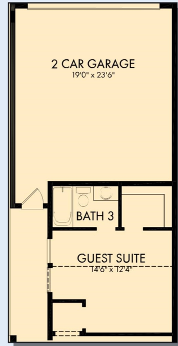
OPTIONAL GUEST SUITE WITH BATH 3