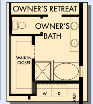
OPTIONAL SLIDE-IN TUB WITH SEPARATE SHOWER AT OWNER'S BATH