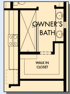
OPTIONAL SUPER SHOWER AT OWNER'S BATH