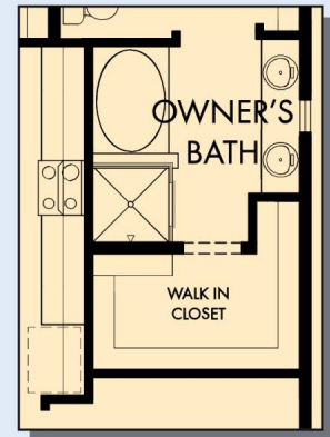
OPTIONAL SLIDE IN TUB WITH SEPARATE SHOWER AT OWNER'S BATH