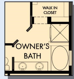
OPTIONAL SLIP IN TUB WITH SEPARATE SHOWER AT OWNER'S BATH