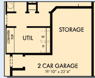
OPTIONAL STORAGE AT 2 CAR GARAGE