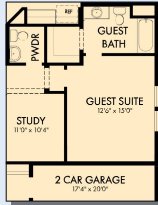
OPTIONAL GUEST SUITE WITH POWDER BATH AT BEDROOM 2 AND 3