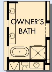
OPTIONAL FREESTANDING TUB WITH SEPARATE SHOWER AT OWNER'S BATH