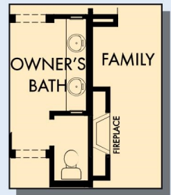
OPTIONAL WALL FIREPLACE AT FAMILY