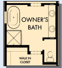
OPTIONAL FREE STANDING TUB WITH SEPARATE SHOWER AT OWNER'S BATH