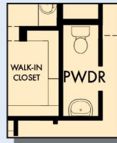
OPTIONAL POWDER BATH AT HALL WAY

3,536 - 3,671 sq. ft. • 5 Bedrooms • 4 Full Baths • 3 Car Garage