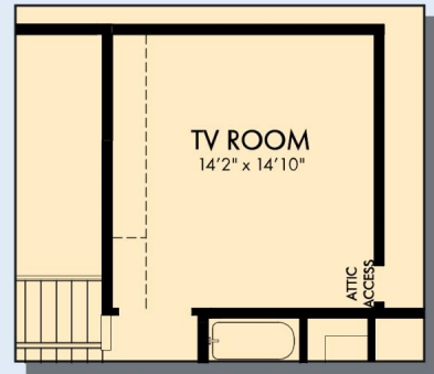
OPTIONAL TV ROOM