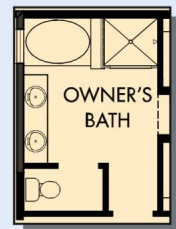
OPTIONAL SLIP-IN TUB WITH SEPARATE SHOWER AT OWNER'S BATH