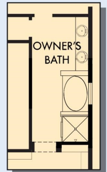
OPTIONAL SLIDE IN TUB WITH SEPARATE SHOWER AT OWNER'S BATH