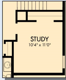
OPTIONAL BEDROOM 4 AT RETREAT