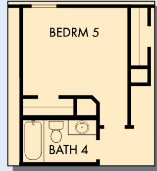
OPTIONAL BEDROOM 5 WITH BATH 4 AT RETREAT