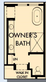
OPTIONAL FREE STANDING TUB WITH SEPARATE SHOWER AT OWNER'S BATH