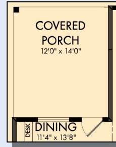
OPTIONAL COVERED PORCH AT DINING