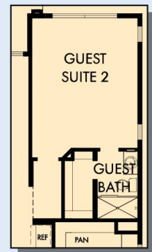
OPTIONAL GUEST SUITE 2 AT STUDY