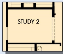
OPTIONAL STUDY 2 AT BEDRM 4

3,624 - 3,627 sq. ft. • 4 Bedrooms • 4 Full Baths • 1 Half Bath • 4 Car Garage