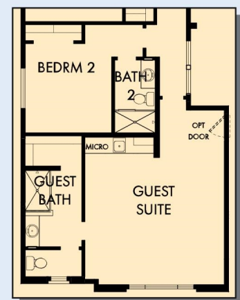
OPTIONAL GUEST SUITE AT BEDROOM 3 AND RETREAT