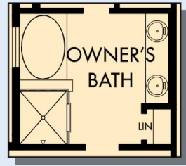
OPTIONAL SLIP-IN TUB WITH SEPARATE SHOWER AT OWNER'S BATH