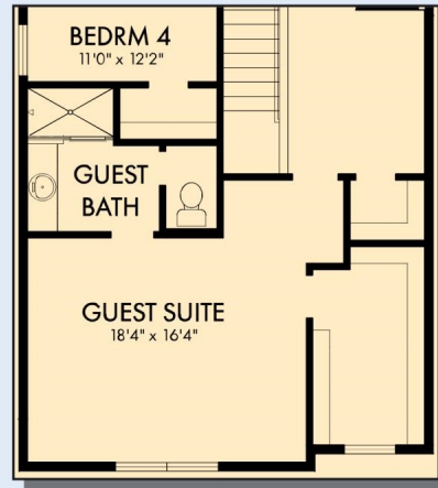
OPTIONAL GUEST SUITE AT BEDROOM 2 AND 3