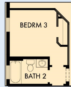
OPTIONAL BEDROOM 3 AT STUDY