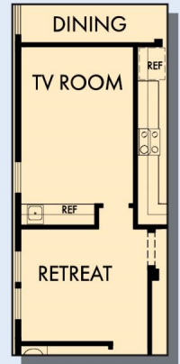
OPTIONAL TV ROOM AT BEDROOM 3